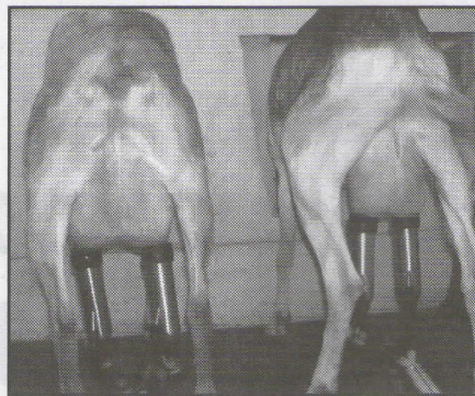
Two goats being milked by one pulsator.

At the heart of a properly functioning pulsation system is the resting time for the teat. Much like hand-milking, there must be an adequate amount of